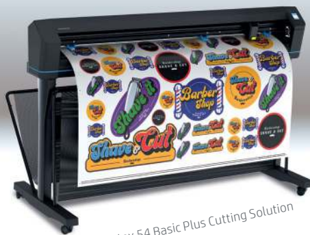
HP Latex 54 Basic Plus Cutting Solution

Grow your business by enhancing your HP Latex printer with our unique print AND cut workflow 1