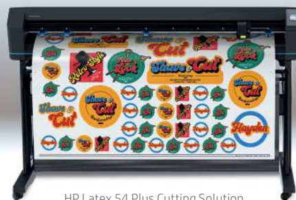
HP Latex 54 Plus Cutting Solution