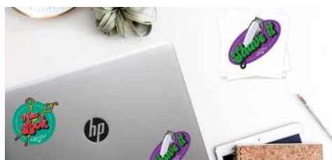
LABELS AND STICKERS