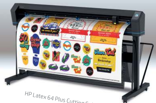
HP Latex 64 Plus Cutting Solution