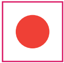
Made in Japan